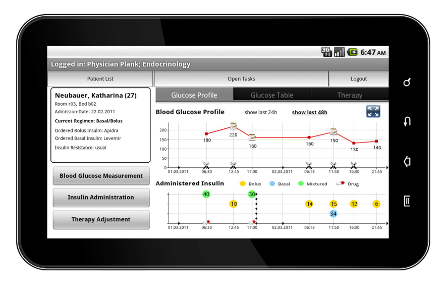
Fig. 2. Decision support application for Safe Glycaemic Control for care givers

The application monitors a range of parameters from various sources including glucose level, nutritional intake, administered drugs and the patient's insulin sensitivity. The data are contextualised and algorithms and physiological models will be used to calculate the required insulin doses for SGC. Results will be delivered to physicians and nurses at the point of care.